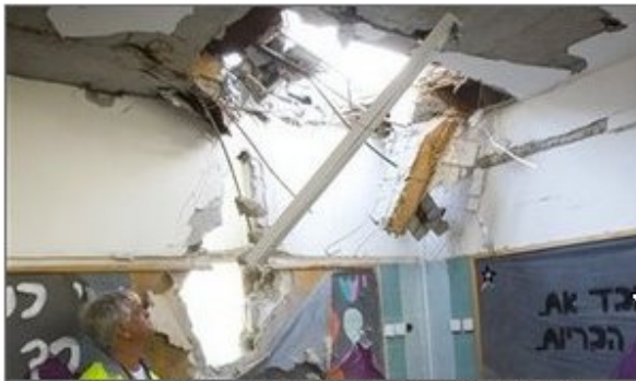
The UNRWA building in Gaza hit by the IDF, Thursday

"This picture with its caption says 1000 words about the media's coverage of Israel's war in Gaza. It's so bad that apparently, even the Jerusalem Post, from whose front page I snipped this, has been taken in: