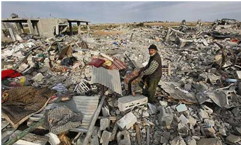
Rubble in northern Gaza neighborhood of Jabaliya

Many of the fatalities were considered to be civilians at first, because there were no weapons found with them, said a military source, "But that method of operation is consistent with the way Hamas was hiding in the midst of civilians, moving between their strongholds with no weapons. In many cases someone thought to be a civilian casualty turned out to be a Hamas operative after we ran our checks."